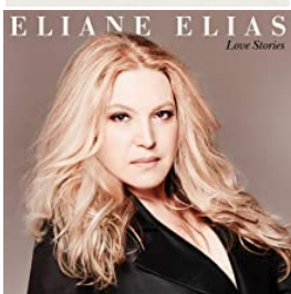
ELIANE ELIAS Love Stories