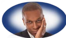
Leslie Odom Jr.