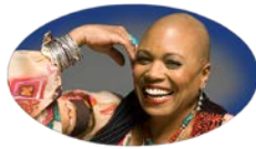
Dee Dee Bridgewater