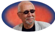
Charles Lloyd & The Marvels